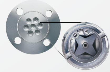
REG Simple and 6-fold

(Diagram: Example of a flow rate of 151/min in relation to a fixed orifice)